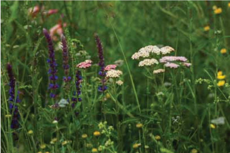
The wildflower meadow