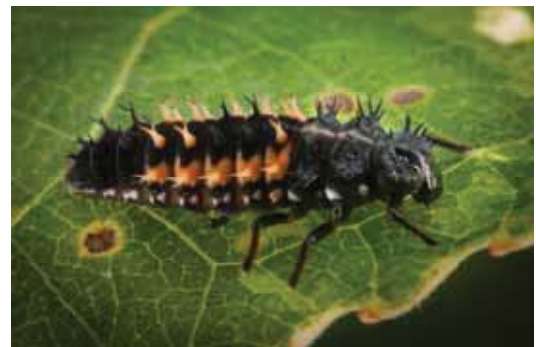
Ten-spotted Ladybirds and Ladybird Larva (above)